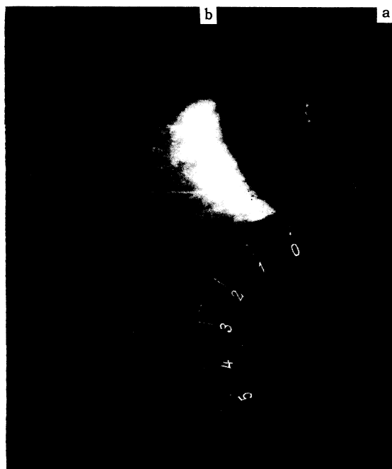
FIG. 1. Comparison of the swept and static pictures of the spark: a) static picture of a spark between electrodes AB (cf. Fig. 2); b) circular sweep of the spark image. One scale division corresponds to 2 \times 10^{-10} sec.

In Fig. 1 we compare the static and time-swept photographs of the spark; this comparison indicates that the time during which the interelectrode gap is bridged is no greater than 10^{-11} sec. Figure 2b shows what would be expected in 1b if one were to observe "streaming" of the streamer channel from electrode A to electrode B during the time of observation, as proposed by Andreev and Vanyukov. A careful comparison carried out for a large number of static and swept photographs reveals no pattern such as that shown in Fig. 2b. Consequently the exact shape of the