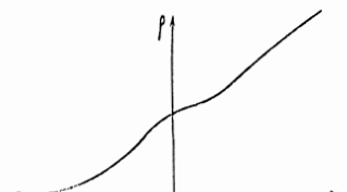
FIG. 1. Density of states of a strongly nonideal plasma.

Formula (6) was obtained under strongly nonideal conditions, \beta v \gg 1 , \beta = 1/kT . It has, however, interpola-