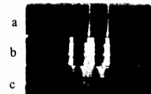
FIG. 5. Coherent radiation spectrum of an \text{Nd}^{3+} -glass laser at various temperatures: a) 290°K; b) 260°K; c) 240°K.

was 96%) was returned back to the resonator because of diffraction. At lower angles of inclination of the rear surfaces of the mirror the emission spectrum acquired a structure which was due to reflection of light from the surfaces of the mirror bases. The laser radiation was focused onto the slit of an STÉ-1 spectrograph and recorded on a photographic film.