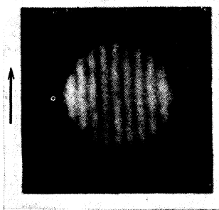
FIG. 1. Photograph of a grating hologram in a vapor of sodium atoms. The period of the grating is 0.5 mm.

To estimate the contributions from amplitude modulation and phase modulation, we tune the output from the writing laser near the absorption lines of hyperfine components of the 3P_{3/2}-3S_{1/2} transition. It follows from Fig. 2 that the maximum in the first order of self-diffraction does